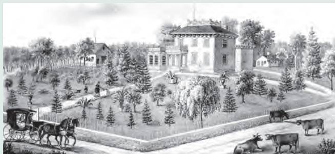
Iowa Gardens of the Past

Iowa Gardens of the Past . Iowa gardens are conspicuously absent from landscape-history books, and Beth set out to rectify that. She discovered that Iowa has indeed had many beautiful gardens, both private and public, miraculously preserved in garden photos and illustrations. She compiled photos and the history of Iowa gardens grand and modest, in small towns and on turn-of-the-century farms, as well as images and garden history created by nationally or regionally well-known garden writers, hybridizers, and horticultural entrepreneurs.