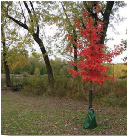
This two-year-old red maple in the Ashton House Project GREEN Gardens grows in the “50 trees for 50 years” celebration of Project GREEN’s fiftieth anniversary.

contributors is being published now). We held no ice cream social or open house, and a planned fall workshop for inoculating our own mushroom logs was cancelled.