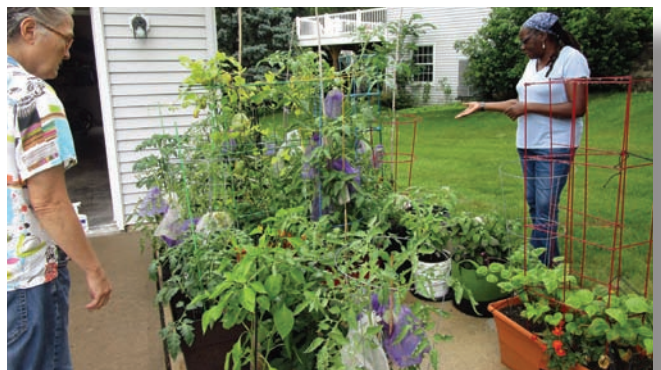
Phyllis Harris shows off her amazing container gardens: over 100 different containers filled with delicious, healthy foods (and some unusual plants too)!

Anyone living within the city limits of Iowa City (and now Coralville!) can open their garden in our event. If you're