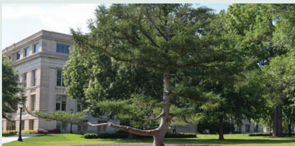
The Larch tree that stood on the UI campus for 60 years.

We hope to see you at the 2022 Project GREEN Winter Garden Forums!