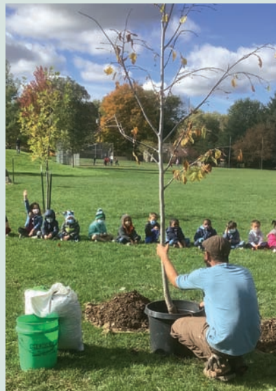
A representative from Iowa City Landscaping demonstrates tree-planting and answers questions from Iowa City kindergarteners each fall.

Oak, Ironwood, Linden, Kentucky Coffeetree, Chestnut Oak, Shagbark Hickory, Turkish Filbert and Frontier Elm. We wish them all many years of green growth!🌻