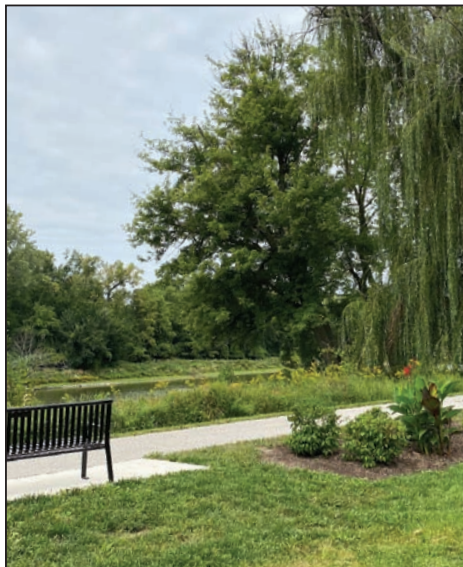
Visit the Ashton House Gardens